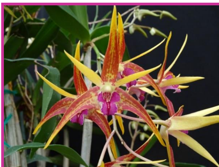
Dendrobium Rutherford Starburst 'Tinonee'