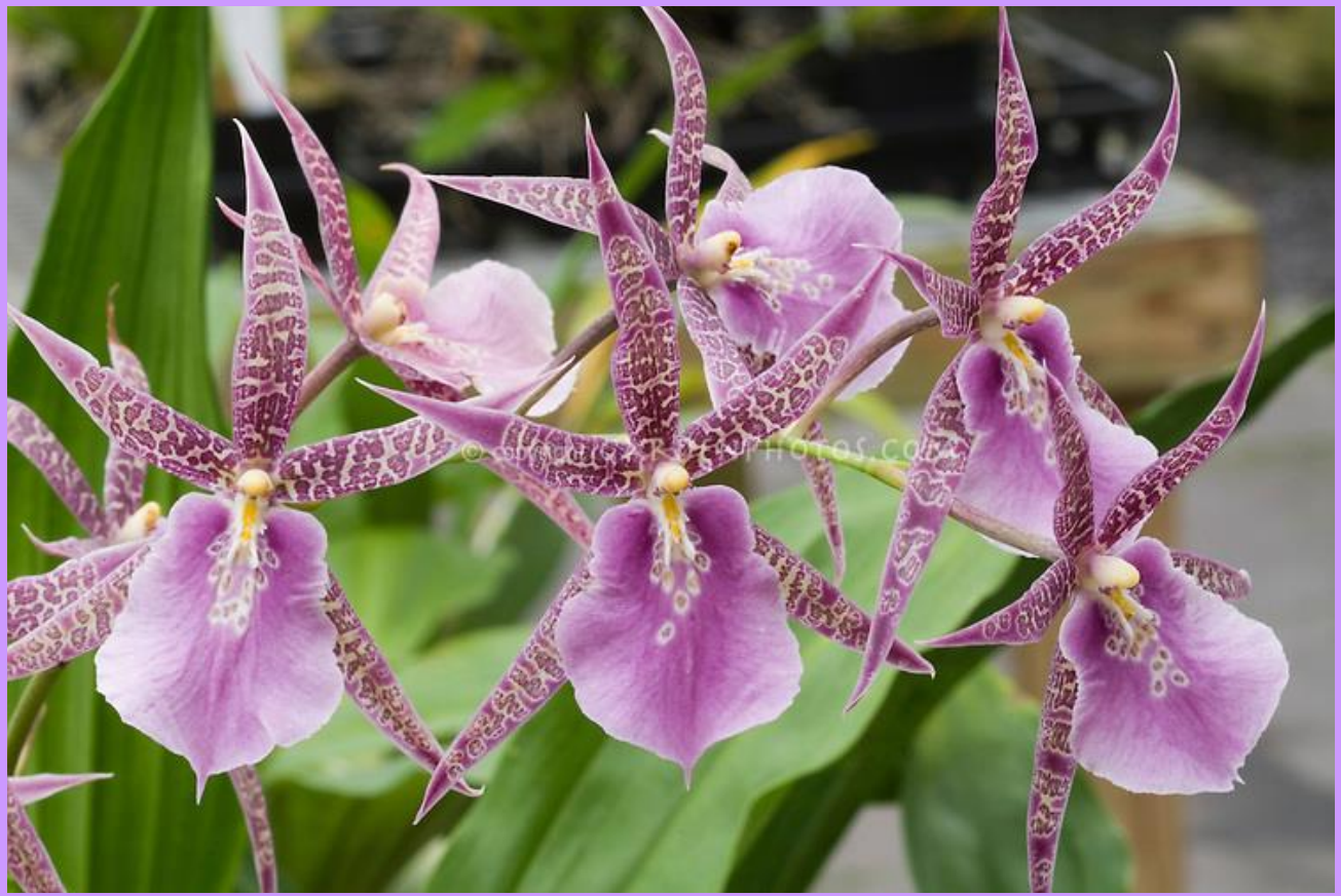
Miltassia Charles M. Fitch 'Izumi'

Albany Orchid Society P.O. Box 1982 Albany W.A. 6331 https://albanyorchids.org.au